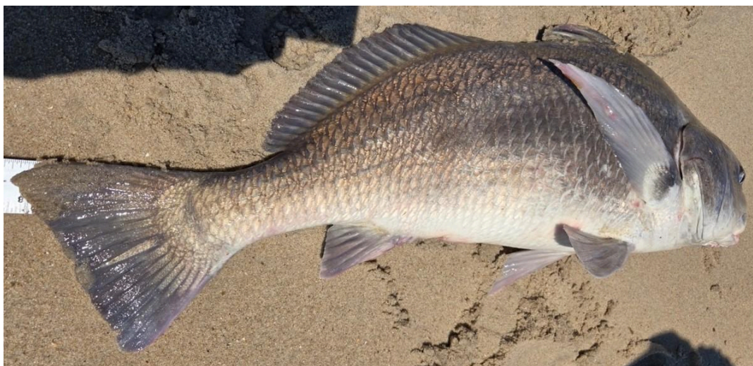
Pat Presutto's Drum - one of many caught & released!