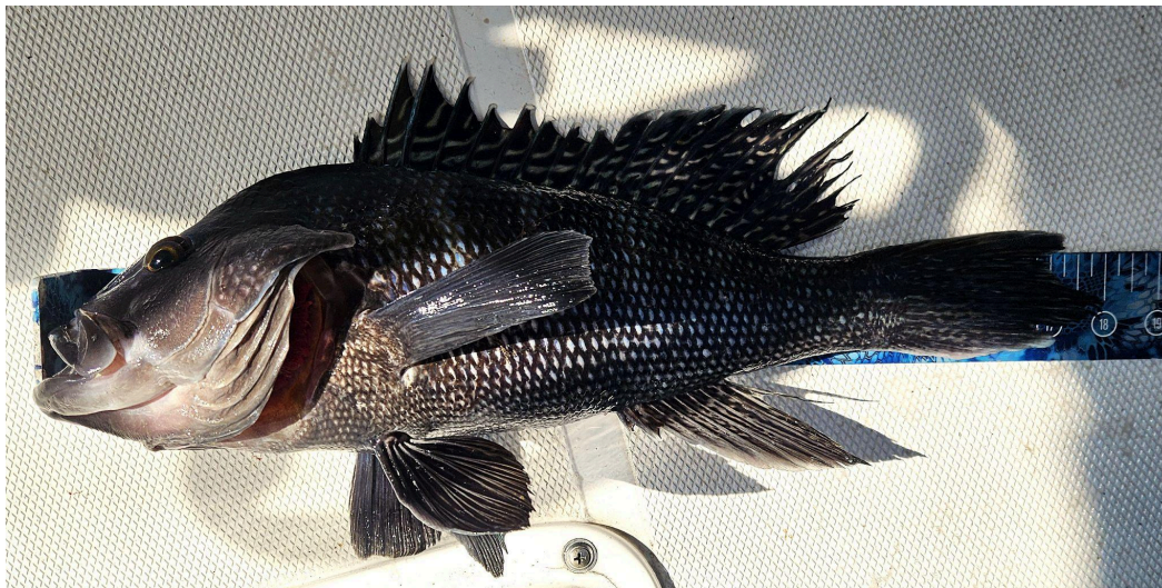
Paul Pintinalli's 18" Sea Bass