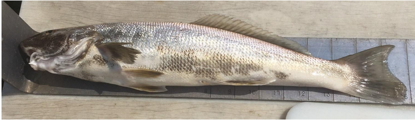
This is a 16" Kingfish