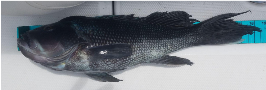
Sea Bass get help from the extra length of their center tail that stretches out a bit. This fine specimen went 18 1/2"

Melanie Boytos Award (MBA) - The angler with the highest point total for any or all species - Striped Bass, Bluefish, Fluke, Weakfish, Sea Bass & Blackfish - will have their name engraved on a special trophy displayed at a local Bait & Tackle store or elsewhere per their request. Points are awarded for your largest catch per species IAW the table listed on our website VHFC Contest Rules