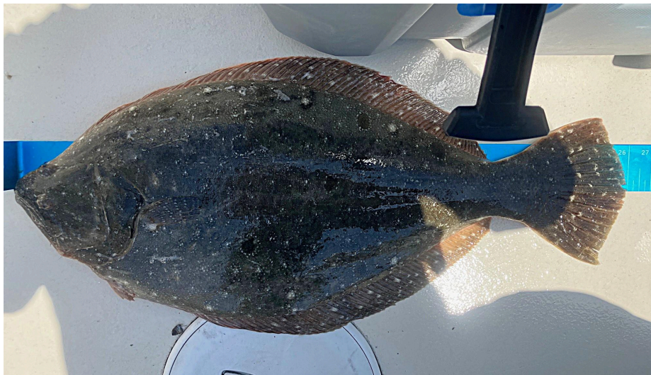
That's the 26" 6.96 Lb Fluke caught by Ed V on the day after Memorial Day in Double Creek Channel