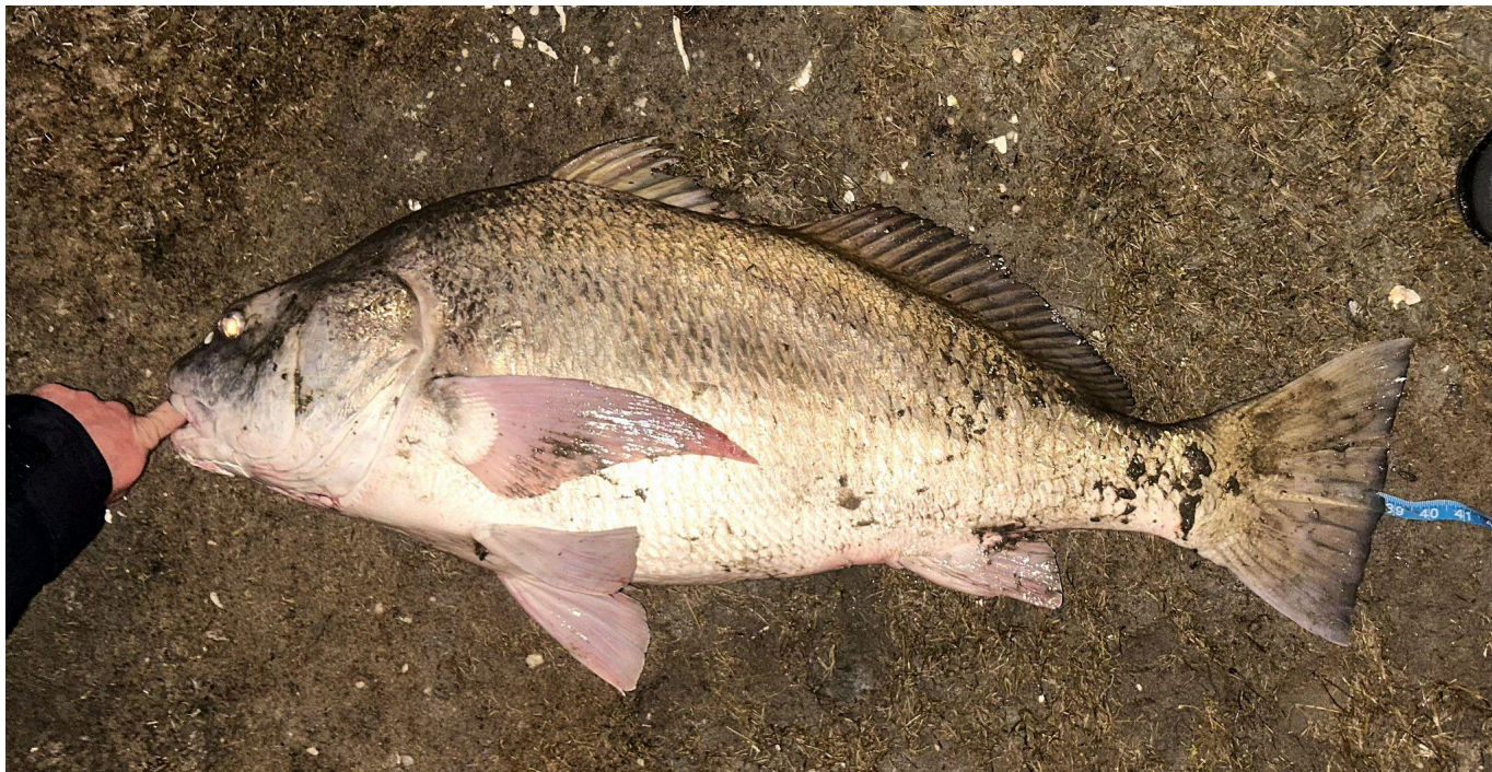
Another picture of Tyler's 39" Black Drum that went 35 lbs on a Boga grip! Fantastic fish!