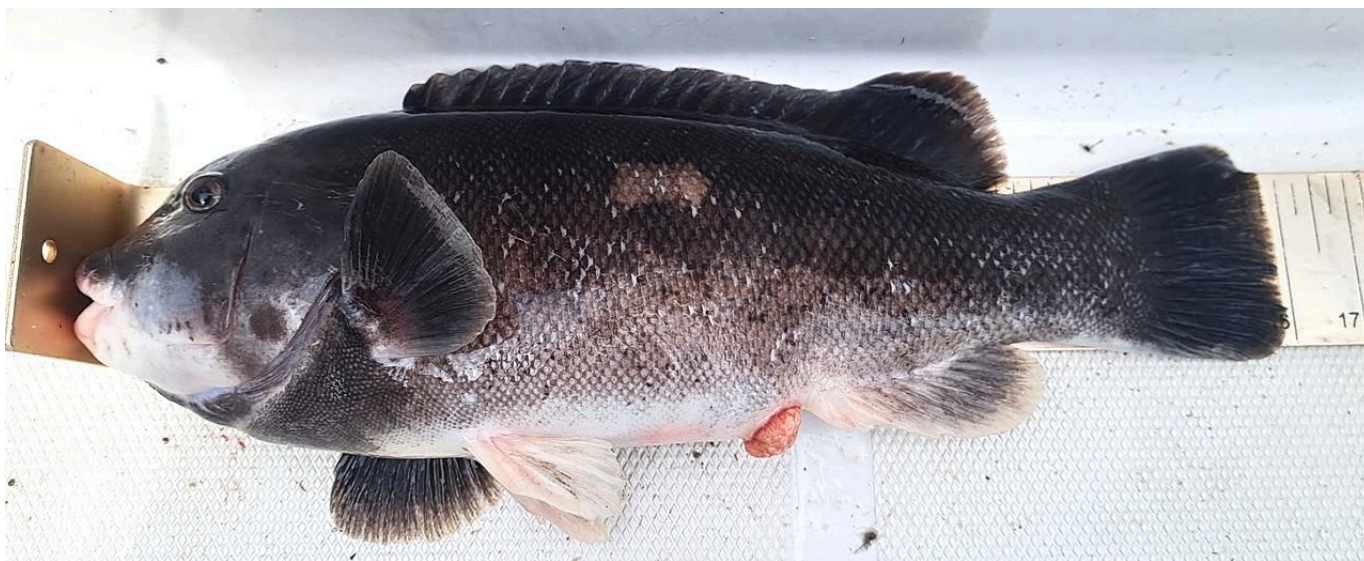
Marty Friedrich and 4 friends started at Little Egg reef but eventually went to the Glory Wreck with slightly better results. Unfortunately, there were still many short fish from 14 to almost 15" but they managed four Keepers to 16" that Will Kresge caught along with a few nice sea bass! Fun day on the water and a good season opener!