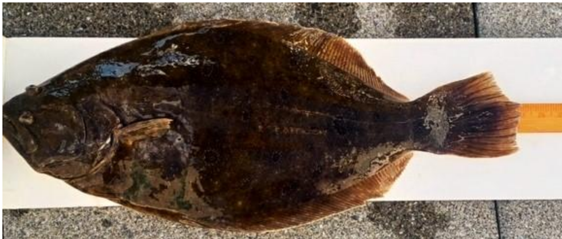
That's Cher Hebert's September FOM leading 25" Fluke