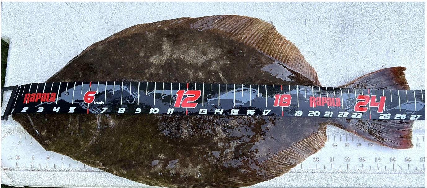
Fantastic Fluke & photo for FOM entry. Tom Godfrey caught this 7lb beast at BL Reef.

Go to VHFC Contest Rules for full FOM entry details. Simply take a photo showing the length of fish atop a rigid ruler. For Striped Bass, pinch the tail. All fish must be in season and legal size except for the FOM for “Over Slot” Stripers which should be quickly measured and released. Bluefish must be 14” minimum. Please send your photos to both Weighmaster Pat Presutto and Ed Valitutto. Pat determines the length but we both keep track of the entries. Pat pat1016pat@aol.com 609 994 8361 Ed edvalitutto@gmail.com 609 994 1311 Here are a few photos to show both the nice fish caught and also how to measure them.