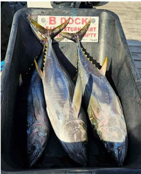
Tim Naples & crew had great catching at the Lindenkohl Canyon connecting on some beautiful Yellowfin Tuna!