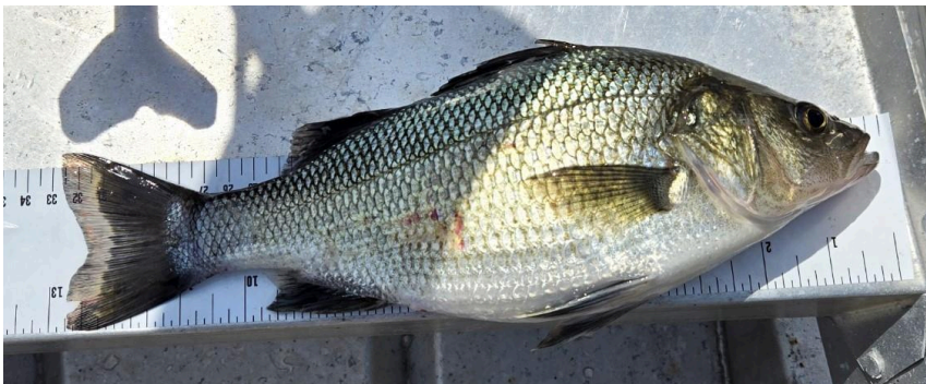
After lamenting about the lack of spring White Perch, Dave Spendiff finally caught two 12.5'' beauties!