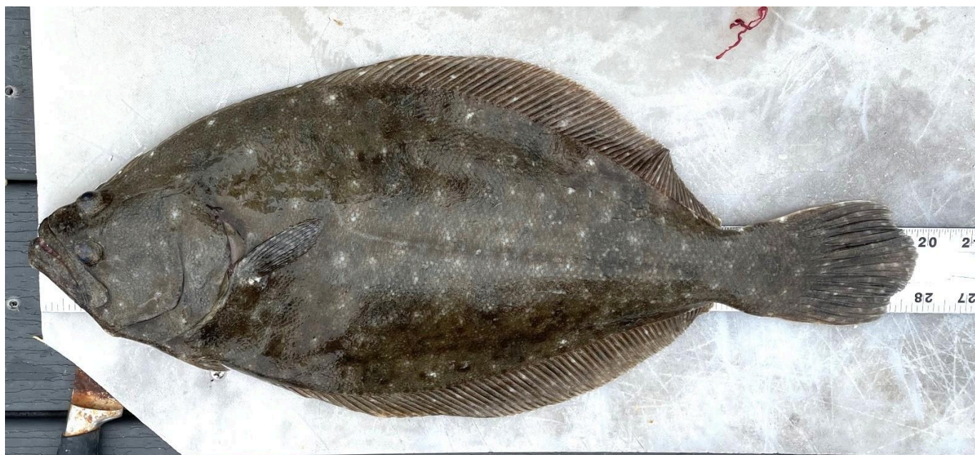
Doug O'Brien submitted this surf caught fluke that went 20" off North Beach

Go to VHFC Contest Rules for full FOM entry details. Simply take a photo showing the length of fish atop a rigid ruler. For Striped Bass, pinch the tail. All fish must be in season and legal size except for the FOM for "Over Slot" Stripers which should be quickly measured and released. Bluefish must be 14" minimum. Please send your photos to both Weighmaster Pat Presutto and Ed Valitutto. Pat determines the length but we both keep track of the entries. Pat pat1016pat@aol.com 609 994 8361 Ed edvalitutto@gmail.com 609 994 1311 Here are a few photos to show both the nice fish caught and also how to measure them.