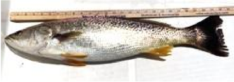
Charles Tortorella's 26 1/2" FOM leading Weakfish