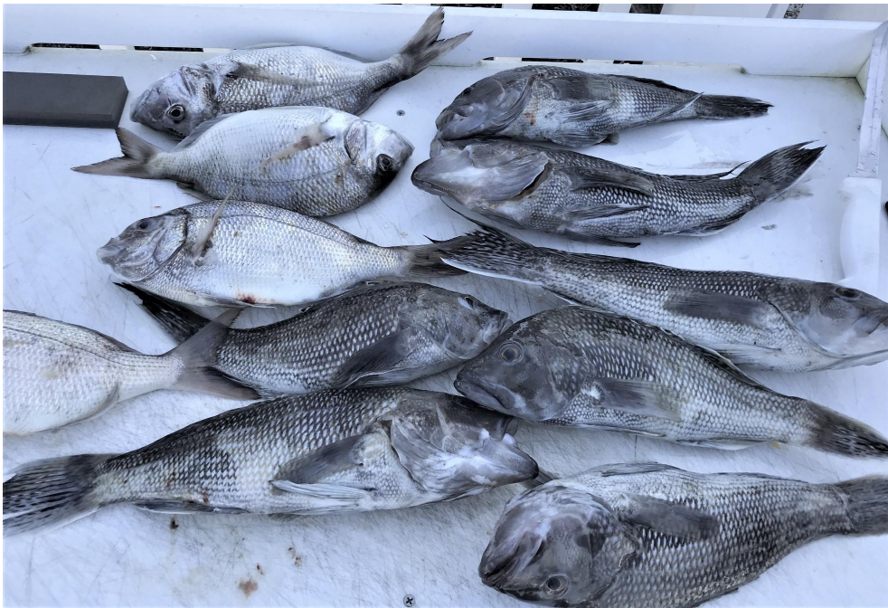
That's Ed V's catch minus a 5 lb bluefish on my cleaning table at my dock.