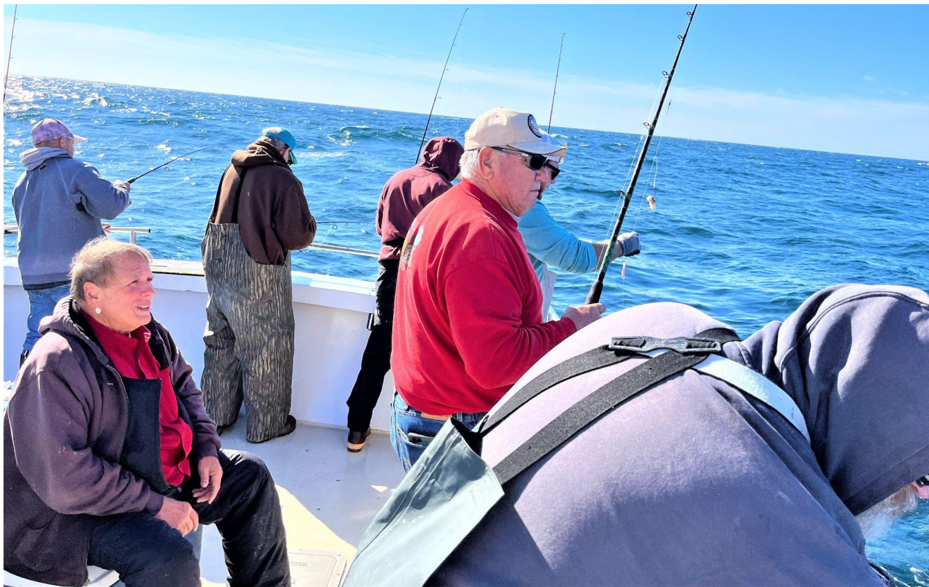
Couple more shots taken on the Super Chic