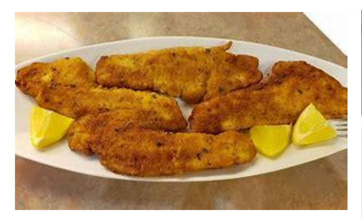
A platter of Southwestern Fried Perch above and a plate of Fish Tacos on the right.