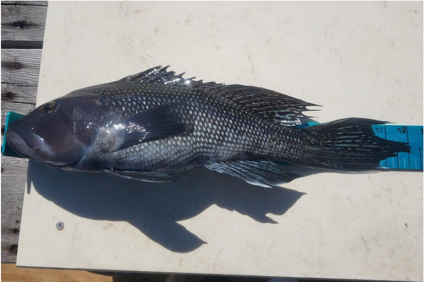
That is one nice 18" seabass and a great photo by Marty Friedfrich!

FISHING REPORTS - Please go to the VHFC website at http://www.vhfishingclub.com to read fishing reports submitted by fellow club members. Please submit your own reports using the simple form on the pull down menu. If you do not feel comfortable using the form, please email Ed Valitutto @ edvalitutto@gmail.com or call / text 609 994 1311 and I will submit a report for you. There were 3 reports for the month of October.