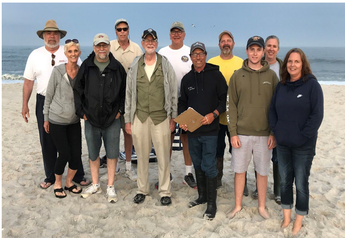
VHFC Volunteer Judges for the 2019 Battle on the Beach

3) FOM Awards - Twenty One (21) Fish of the Month $50 FHQ gift certificates were available this year to club members. A table with all the winners appears later.