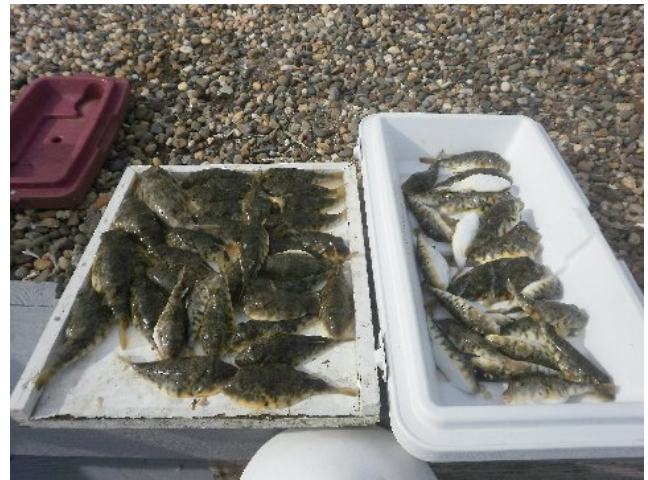
The Fruits of Tom's Labor!