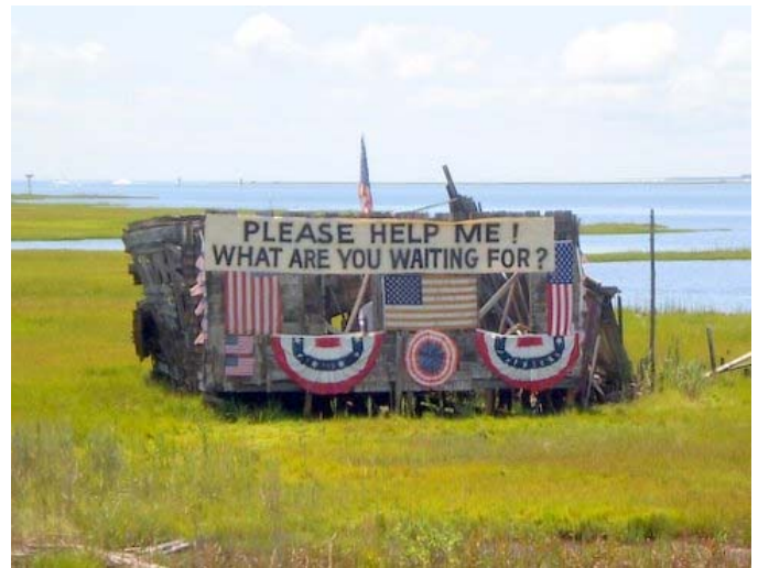
The Shack Today

Here is some history on the Shack. "Happy Days" as the Shack was called back then, was built in the 1920s on the other side of Route 72 with 2 other shacks. One other shack, fenced in, still remains on the other side of Route 72. Huey Singleton moved the shack when the Causeway Bridge was going to be