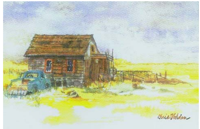
A Sketch of the Shack in Better Times

built around 1957 to where it is today. The Shack was used for hunting, fishing and clamming.