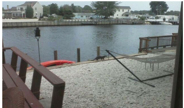
My Mystery Guest!

Have any of you seen anything like this living in the lagoons? My son took the attached picture today of what looks like a little sea otter (the picture quality isn't good – he took it from inside the house on a camera phone!). The otter (or whatever it is) climbed out of the lagoon, hung out a bit on our dock, and then went swimming back down the lagoon (mill creek). I actually think has been visiting our dock regularly over the last week using it as his porta potty, when we came down this week, the dock was a bit of a mess right where you see him standing in this picture (thought it was the geese). We have a ramp at the end of the dock (put there in case our not so smart lab falls into the lagoon), so there is easy access up to the yard. Just wondering if you would have any idea what this is!