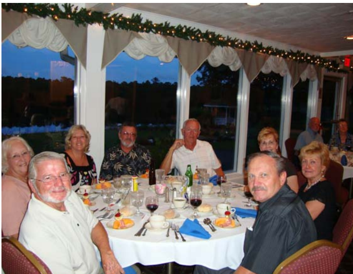
Man, These Fishermen Clean up Well When It's Time to Party!