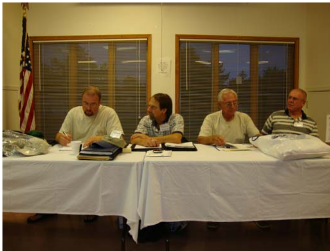
Our Board Members at the August Meeting

sights along the way. Yellowstone is of course, beautiful. We have been to a lot of National Parks & have traveled the states of NJ, Pa, Oh, Ind, IL, Wis, Minn, SD, ND, Mont, Wy, Id, & WA so far. Once we hit Oregon, we will have done all of the lower 48 over the last 4 years. I highly recommend seeing the USA. The people and the views are really something to see!