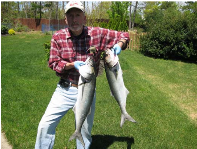
Bill, did you catch these fish trespassing in your backyard?