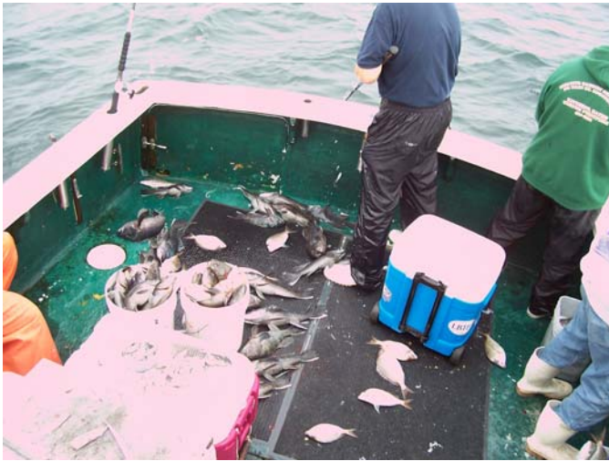
Now that's a lot of fish when you can't keep up with the ones on the deck!

This report is on our May 22 & 23 rd fishing trip up to Mass. We caught cod- Pollack - striped bass- black fish - sea bass - porgies- mackerel. Most fish we've caught in 2 days of fishing actually 1.5 days the sat trip was a 10 hr trip & the sun trip was a 7 hour trip. I'd estimate we got about 1000 lbs of keeper fish and several more hundred pounds of throw backs. UNBELIEVABLE!!!! My dad is visiting from Portugal so I wanted to get him out. He still can't believe the amount of fish we caught. It all went to good use as we gave a lot of it away to friends, neighbors and some to a food pantry for needy people.