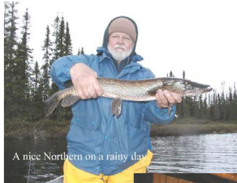
A nice Northern on a rainy day