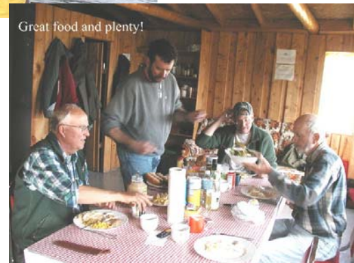
Great food and plenty!

through La Tuque to Lake Saint Jean and into the wilderness near Chibougamau. The last leg was a 12 mile stretch of rough logging road.