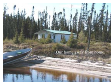
Our home away from home.

The Pike were caught on spoons and plugs cast toward shore or in the shallow back bays. The Walleye were caught on jigs tipped with night crawlers while drifting productive structure. Some of the light jigs we use in the bay were very effective with the Walleye.