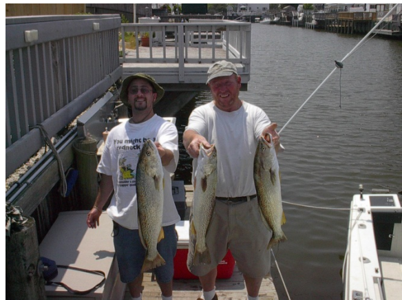
Weakfish are Back, but not like these!