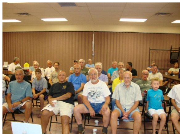
Come on Guys, the News Isn't that Bad!!