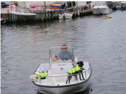
1996 Boston Whaler for Sale