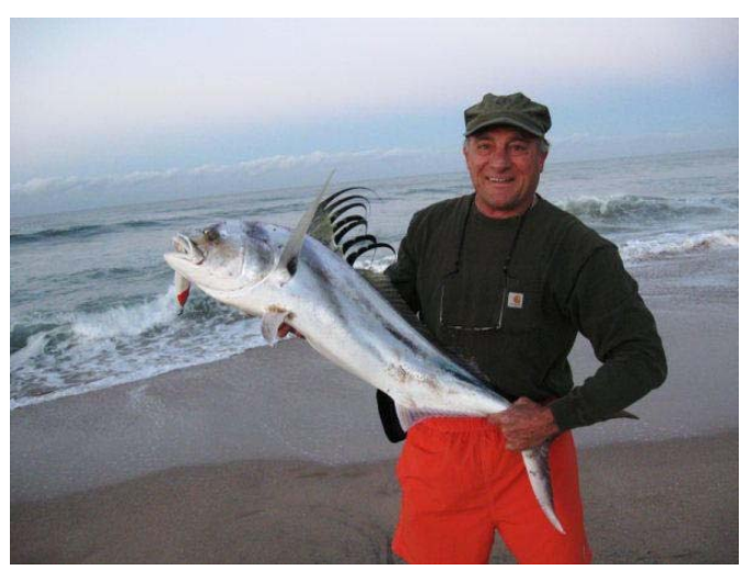
It's a Roosterfish!