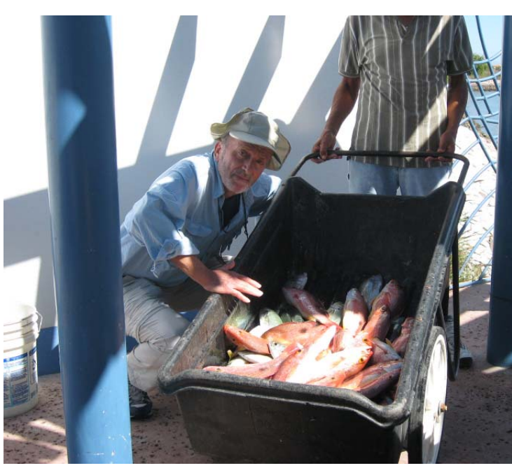
Good Thing You've Got a Cart for All Those Fish!