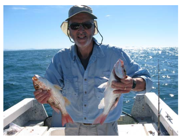
The Fish On the Right Is the Older Brother!