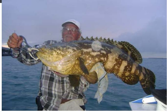
Now, that's a Grouper!