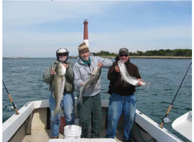
(I Think I Know Where They're Fishing) The 3 Amigos with Nice Stripers!

believe!), we didn't get any more bites, so we packed it in for the day and headed home.