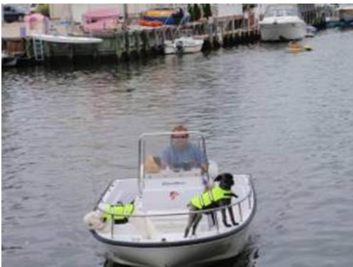
1996 Boston Whaler for Sale