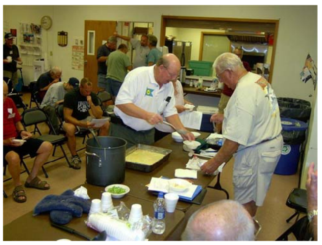
We even saved some for our President!