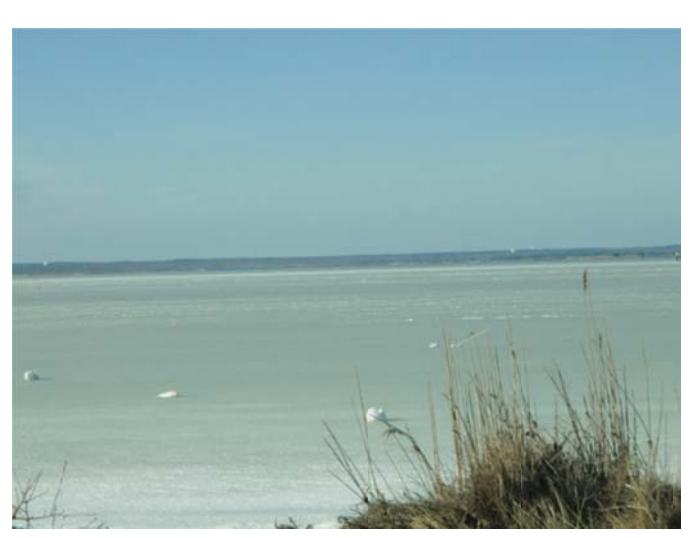
No, It Was January 2010!